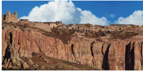
Acoma Pueblo high above the desert

This year's Pilgrims arrived in Albuquerque and went directly to the Acoma Pueblo - Sky City - the oldest continuously inhabited city in North America, more than 1000 years old. It sits on top of a 400 foot high mesa in New Mexico.