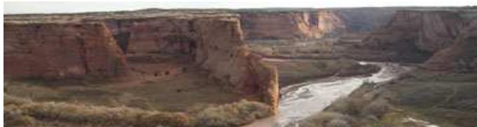
Canyon de Chelly

They next went to Good Shepherd Mission in Navajo Land, Fort Defiance, Arizona. A significant gift of Native American spirituality is its attachment and focus on the land as an expression of the Creator's love and one of the much respected books of God's revelation of his will and way for the people to live. At Good Shepherd the Pilgrims worked for three days on a sustainable agriculture project. Much of Navajo land has been invaded by exotic plant species that have destroyed the native ecology. The Pilgrims planted many trees and explored the confluence of God's justice, peace, empowerment and ecology. They met Navajo elders who spoke with them, and they enjoyed learning how to make a Navajo staple and treat - fry bread. The last evening there they did an amazing hike into the Red Slick Rock formations made famous by the artist Georgia O'Keefe. A beautiful moment was Communion celebrated at the top of 400 foot cliff at sunset with the young couple who were our guides and who had never experienced Communion together before.